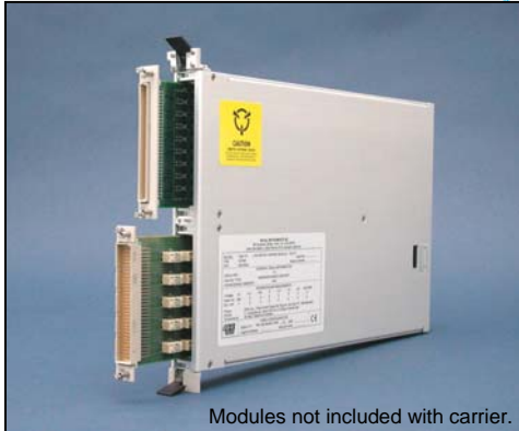
Modules not included with carrier.