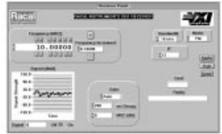
Receiver Control Using VXIplug&play Software Front Panel

Harness the power of DSP technology by loading the 2561's on-board flash with user-specified demodulation schemes, filtering or complex functions. Flash memory may be re-programmed any time over the VXIbus transforming the 2561 into a custom receiver for special applications.